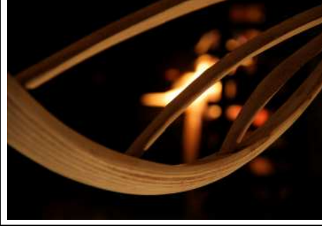
Beautiful works of Art from sustainable sources

Most of Grant's work is on one-off commissions for contemporary fine furniture, made from British or European hardwoods. These are beautiful and functional pieces, individually designed after consultation with the client and hand-made to the highest standards. Anything from refined dovetailed boxes and cabinets to eye-catching dining suites, kitchen and bedroom furniture. And as well as the very high-end furniture Grant also makes affordable and practical fitted furniture for households in the local area. Shelving for an awkward corner, cupboards and wardrobes to fit your particular rooms – the sort of things you can't get in Ikea.